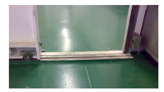
Option: Low sill

Max. 25 mWc (i.e. test pressure) at size 2000x800 mm Limited to 8,5 mWc (i.e. test pressure) at size 2100x1400 mm